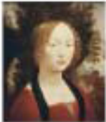
1512 — Self Portrait